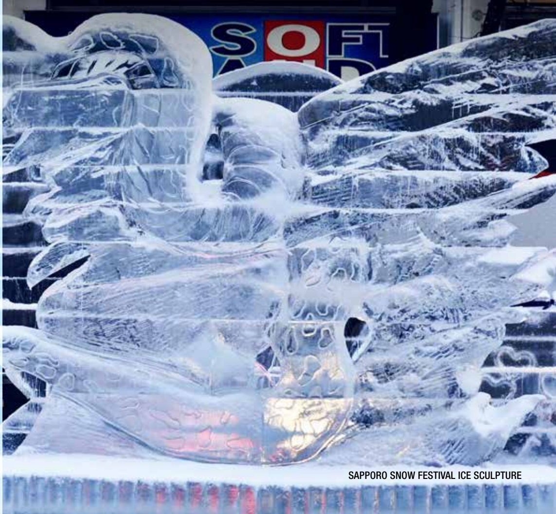
SAPPORO SNOW FESTIVAL ICE SCULPTURE

Enjoy a private cultural performance of Taiko drumming and Samurai dance at Shirikawago, immerse yourself in one of Japan's most acclaimed indulgences—a stay at a lovely ryokan—a traditional Japanese Inn.