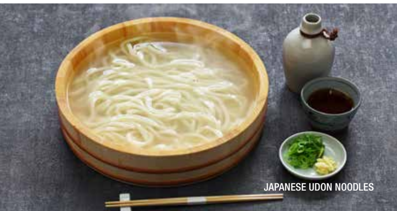
JAPANESE UDON NOODLES