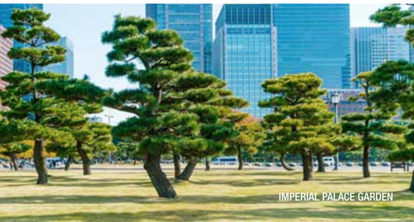
IMPERIAL PALACE GARDEN