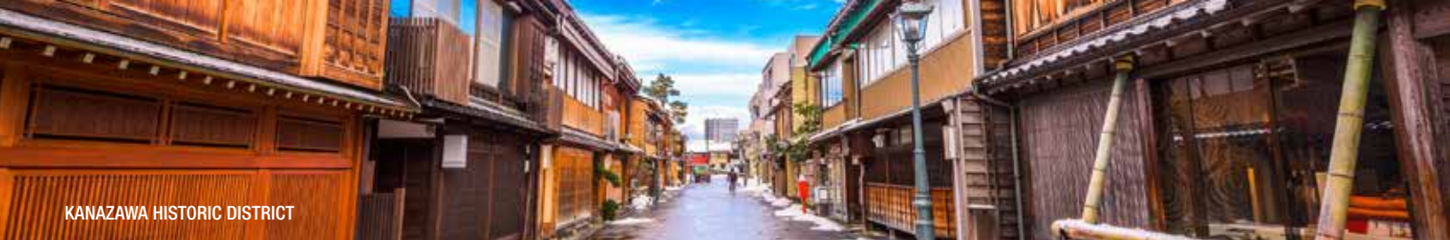
KANAZAWA HISTORIC DISTRICT