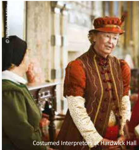
Costumed Interpreters at Hardwick Hall