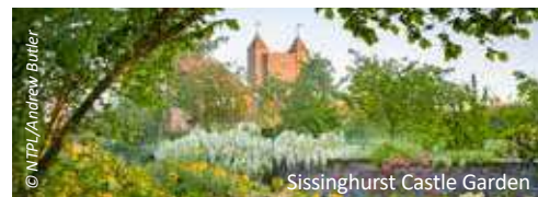
Sissinghurst Castle Garden

*Please note: the 2021 tour itinerary may differ slightly from the 2022 itinerary shown.