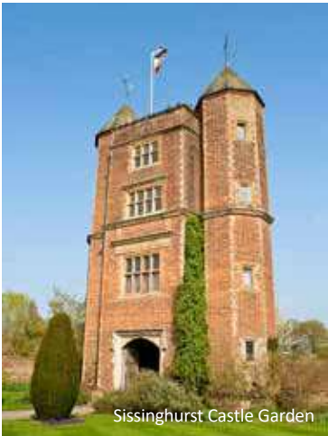
Sissinghurst Castle Garden