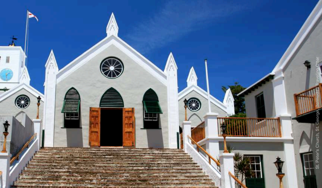
St. Peter's Church, St. George, Bermuda.